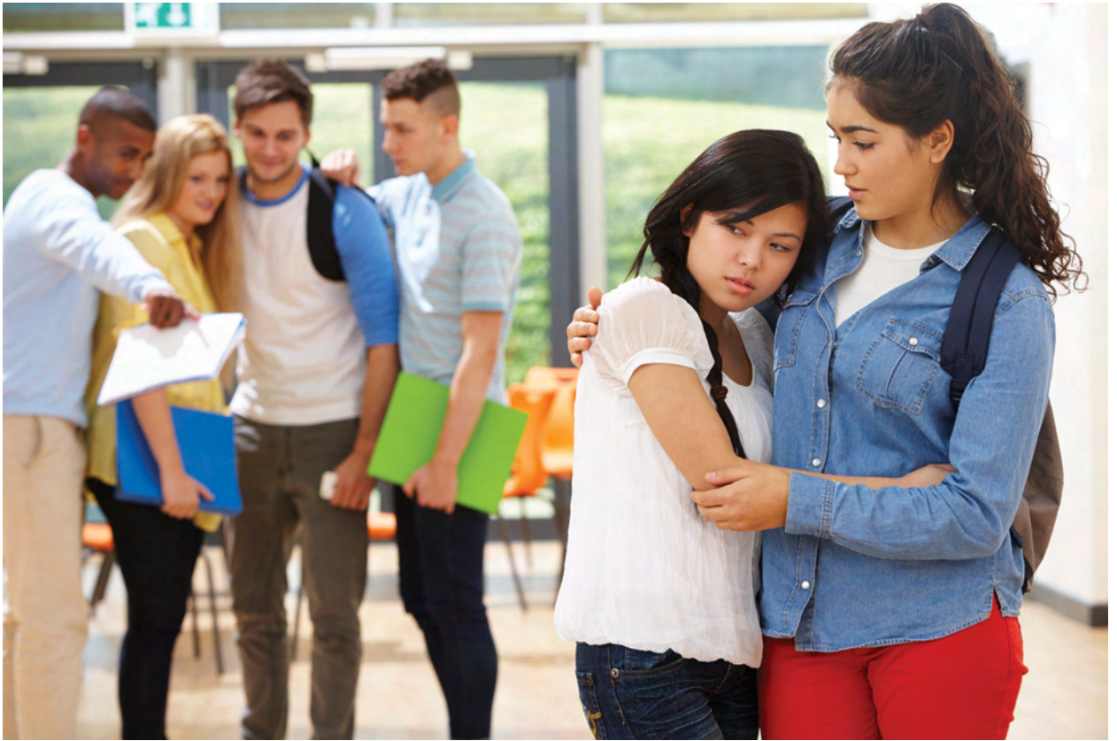
Image #21